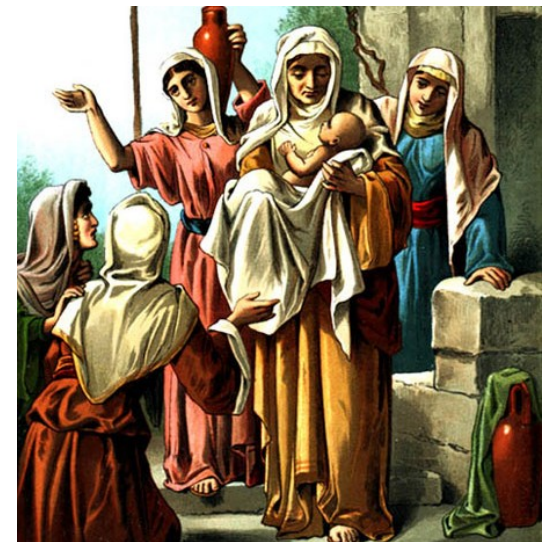
Naomi receives Obed from the woman of the city.